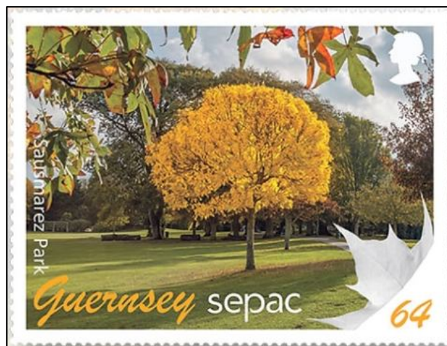
Guernsey's 2016 Sepac stamp shows autumn at Saumarez Park, the island's largest public park.

Autumn in Saumarez Park is pictured on the Sepac-inscribed stamp issued May 25 by the Channel island of Guernsey.