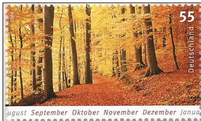
The months of autumn are outlined in dark orange at the bottom of this 2006 stamp from Germany.

A United States stamp related to fall does not include the word as part of its design. On May 3, 2013, the U.S. Postal Service issued four nondenominated forever stamps showing the flag in the different seasons. The Flag in Autumn design depicts aspens covered with golden leaves behind the flag. Several varieties exist of the A Flag for All Seasons stamps.