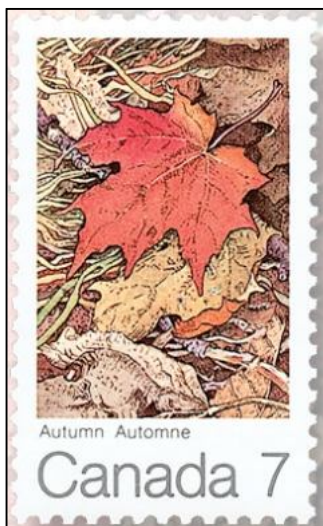
A 1971 Canadian stamp celebrating the season of autumn shows maple leaves.

Many of the stamps featuring this season are inscribed with the word “autumn.” For example, a 1971 7¢ stamp from Canada bears that word in both English and French. This stamp is part of a series of four showing Canada’s national symbol, the maple leaf, in different seasons: The Spring stamp was issued April 14 (Scott 535), Summer June 16 (536), Autumn Sept. 3 (537) and Winter Nov. 19 (538). Canadian artist Alma Duncan (1917-2004) created the illustrations for this series.