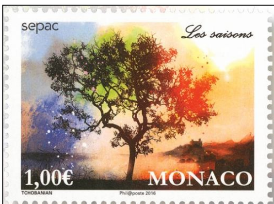
A tree for all seasons is pictured on this stamp from Monaco, part of the 2016 Sepac multination series.

Monaco used a single tree to represent all four seasons on its Sepac stamp issued June 24. The golden colors of autumn are prevalent on the right side of this 1 stamp.